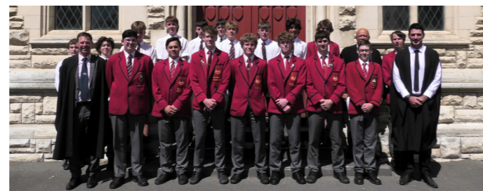
ACHIEVEMENT IN NCEA (PARTICIPATION BASED DATA) - WAITAKI BOYS' HIGH SCHOOL

In 2023 we were pleased to see our pass rates across all levels of NCEA significantly above the national boys average and of those schools with a similar equity index.