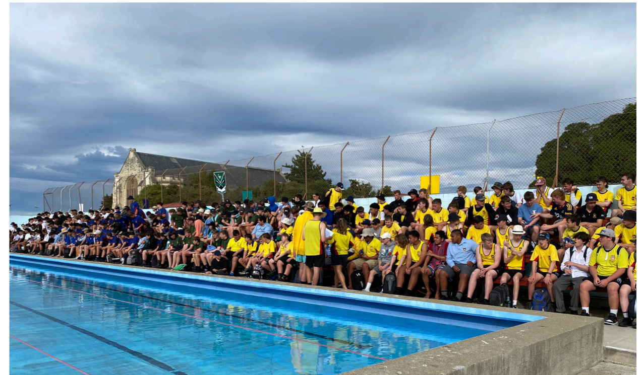
The extensive grounds provide outstanding recreational and sporting facilities onsite.

The 97 year old Hall of Memories is a Category 1 NZ Historic Places Trust building. With its Oamaru stone exterior, mature timber interior resplendent with pipe organ it is the 'heartbeat' of our school. Jacinda Ardern, NZ's former Prime Minister, on her recent visit to the school specifically mentioned how impressed she was with the Hall of Memories – in her words “the most impressive school building she had ever been to”